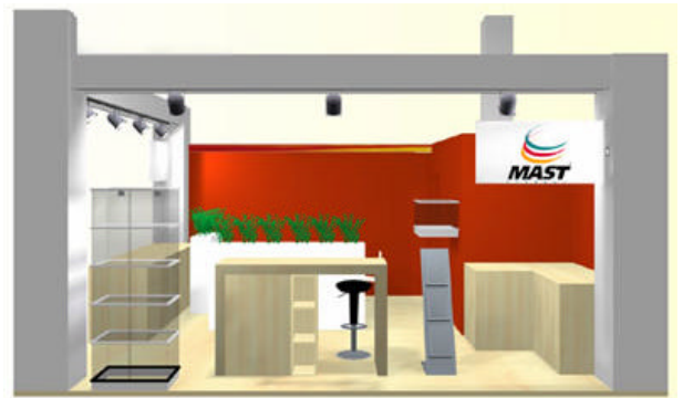
Hall 1 Stand 7g13

UDO (Ultra Density Optical). It is the first storage technology specifically designed for professional data archiving applications. UDO offers 30 GB of capacity, 8 MB/s of uncompressed transfer rate and it has a roadmap defined for two more generations. MAST UDO allows long-term data retention: the information remains unaltered for even longer than 50 years.